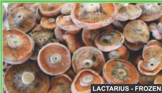
LACTARIUS - FROZEN

Fresh and healthy mushrooms of Lactarius deliciosus are separated and cleaned of impurities, then wash, dry and preparing for freeze. As the frozen, are produce into two classes: 1. Whole without worm; 2. Cube with 2x2cm size. There are packed in cardboard or plastic bags depending on the customer's wishes.