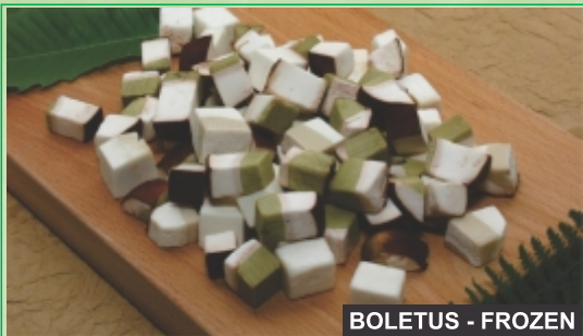
BOLETUS - FROZEN

U Makedoniji je ima tokom cela jeseni. Pakuje se kao sveža u drvenim holandezima, proizvodi se takođe i u suvom stanju.