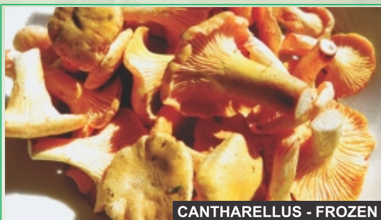
CANTHARELLUS - FROZEN

Plodovi se mehanički čiste, blanširaju, zatim se duboko zamrzavaju u rastresitom stanju. Vrši se klasifikacija u zavisnosti od želje kupca i pakuje u kartonsku ambalažu. Obično se klasifikuje prema veličini na dve ili tri klase.