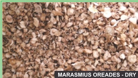
MARASMIUS OREADES - DRY

Suva lisičara (sušarska) u ponudi je u sledećim klasama: I klasa, original, industrija. Može se pakovati u sitnim pakovanja ili kao refus od 5kg do 10kg.