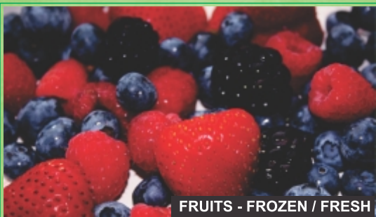
FRUITS - FROZEN / FRESH

Očišćenu robu posle mariniranja i prerade klasifikujemo na sledeći način: od 0 – 3 cm; od 3 do 5 cm; od 5 – 8 cm i kocka. Sve pakujemo u burad od 150 kg neto robe.