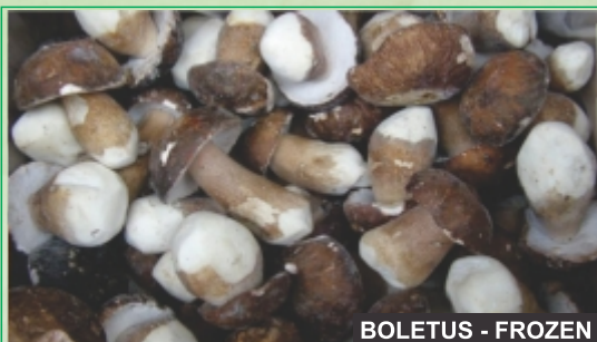
BOLETUS - FROZEN

Mushrooms are cleaned, blanched, then deep frozen in a loose condition. Classification is done according to wishes of the client and packed in cardboard boxes. Usually is classified, according to the size, in two or three classes.