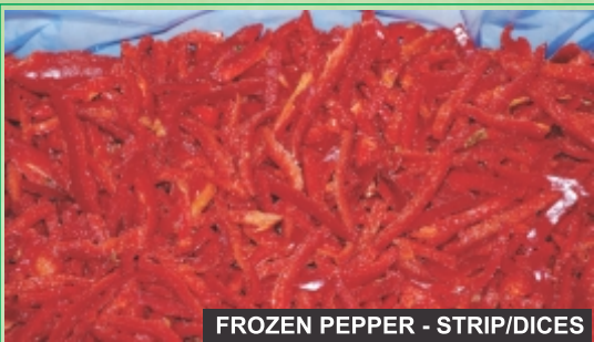
FROZEN PEPPER - STRIP/DICES

Nakon selekcije i odabira zdravih i crevenih plodova paprika se pere, zatim suši i peče na drva. Proces pečenja se odvija na specijalnim prohromskim pećima napravljenih specijalno za ovu namenu. Gotovi proizvodi se selektuju po klasama u zavisnosti od veličine: 1. klasa \geq 14 cm; 2. klasa od 8 do 14 cm; 3. klasa \leq 8 cm. Pakuju se u kartonskoj abalaži neto težine od 7 – 10 kg.