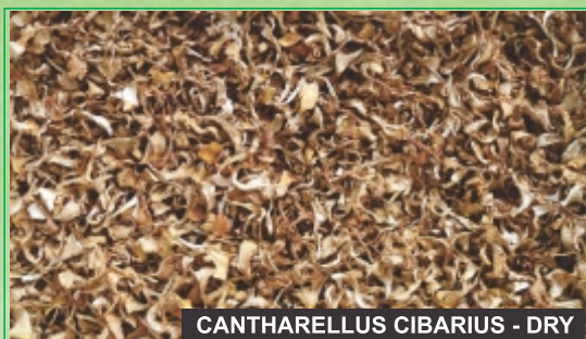
CANTHARELLUS CIBARIUS - DRY

Program suvog vrganja obuhvata dve kategorije: Suv vrganj (sušarski) – u ponudi su sledeće klase: I extra; I klasa; II klasa; III klasa; krupna bricola; sitna bricola; DPS; industrija. Suv vrganj (original) – u ponudi su sledeće klase: original extra; original; original granulat; bricola; industrija. Sitna pakovanja: 20g/30g/50g/80g/100g/200g/300g/500g/1kg; Refuzna pakovanja: od 5kg do 10kg.