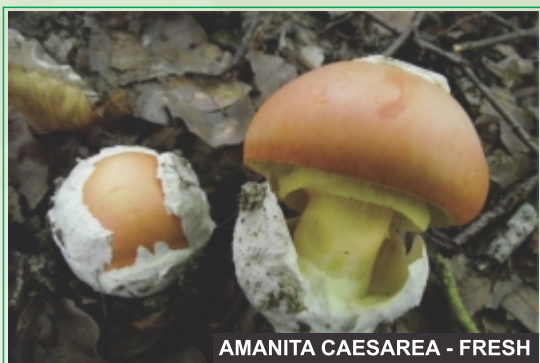
AMANITA CAESAREA - FRESH

Lisičara se čisti od mehaničkih nečistoća, razvrstava po veličini i pakuje u drvenu ambalažu neto težine 3kg; 1kg; ili 0.5kg; 0,4kg i 0,2kg u zavisnosti od zahteva kupaca.