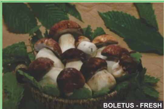
BOLETUS - FRESH

As required by customers the cep is classified into three classes according to color, beard (from white through yellow to green) and according to the firmness. Also classified according to the size: S - small, M – medium, L – large It is packaged in wooden crate with an average net weight of 3kg. and 1.5kg.