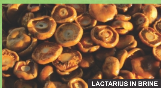
LACTARIUS IN BRINE

After marination we grade the cleaned goods according to their size: to 0 to 3 cm; from 3 to 5 cm; from 5 to 8cm and cube. Everything is packed into barrels of 150 kg net of goods.