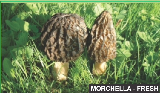
MORCHELLA - FRESH

Nakon prijema čisti se od zemlje presecanjem drške (ostavlja se max. 1 cm), razvrstava prema veličini : S – small (od 0 – 3 cm), M- medium (od 3 do 5 cm), L – large (od 5 do 8 cm) i pakuje u drvene holandeze.