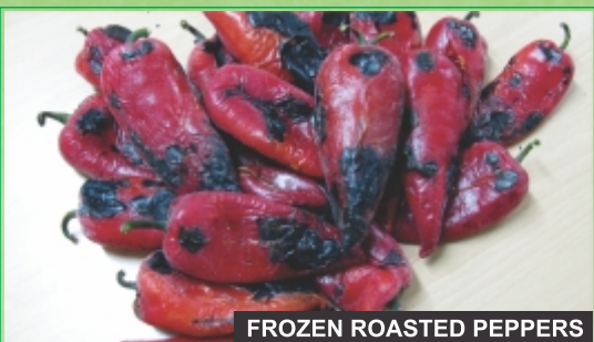
FROZEN ROASTED PEPPERS

Nakon čišćenja od mehaničkih nečistoća roba se kontroliše i zamrzava u tunelima za brzo zamrzavanje. Program sumskog voća obuhvata sledeće proizvode u zamrznutom i svezem stanju: borovnica (rolend, original); kupina (rolend, original, griz); malina (rolend, blok); sipurak; sumska jagoda. Proizvodi se pakuju kao zamrznuti u kartonskoj ambalaži neto 10 kg; PVC vrećama 20 – 25 kg; ili u sitnim pakovanjima za sveže proizvode.