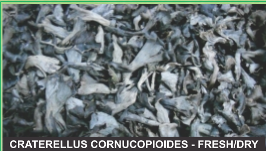
CRATERELLUS CORNUCOPIOIDES - FRESH/DRY

Dosta rasprostranjena gljiva u Makedoniji (conica, rotunda). Javlja se u rano proleće, izuzetnog je ukusa. Radi se u svežem, suvim i zamrznutom stanju.