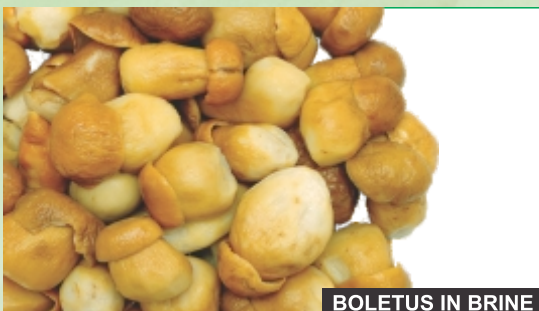
BOLETUS IN BRINE

Suva livadarka (sušarska) u ponudi je u sledećim klasama: I klasa, original, industrija. Može se pakovati u sitnim pakovanja ili kao refus od 5kg do 10kg.