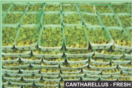
CANTHARELLUS - FRESH

Prema zahtevima kupaca vrganj se klasifikuje u tri klase prema boji spora (od bele, preko žute do zelene) i prema čvrstoći. Takodje se razvrstava prema veličini na: S – small (mali), M – medium (srednji), L – large (veliki) Pakuje se u drvene holandeze prosečne neto težine 3kg. i 1.5kg.