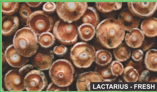
LACTARIUS - FRESH

After the receiving it's cleaned from the mechanical impurities and with the eliminated stem (left maximum one centimeter) and classified according to the size: S - small (0-3 cm), M-medium (3-5 cm) and, L - large (5-8 cm), It's packed in wooden crate.